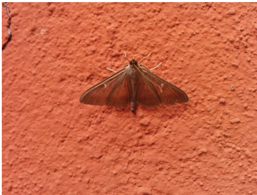
Fig. 6. Melanic specimen of C. perspectalis on a wall at the Village of Bargone (August 2016).

On 31 st August, at Pian del Lago (GE), at 700 m. a.s.l. near the marsh of Monte Roccagrande, Buxus plants were leaves-rich, but by a more accurate inspection we found some caterpillars at different stages; the flight of non-melanic adults was considerable. There was then a displacement in the age distribution of moth populations set at slightly different altitudes, corresponding to a few degrees of difference in temperature. Adults were massively resting on Eupatorium cannabinum L. (cf. Pinzari et al. 2015), known nectar plant for Euplagia quadripunctaria (Poda, 1761) too, a priority species under conservation according to Annex. II of Habitats Directive 92/43 EC, possibly ecologically displaced by the crambid. In fact, during our inspections E. quadripunctaria was never observed despite the fact in previous years numerous individuals had frequently been observed in the site.