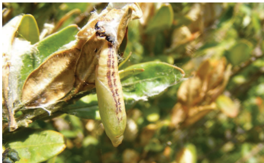
Fig. 5. A C. perspectalis pupa on Box tree.