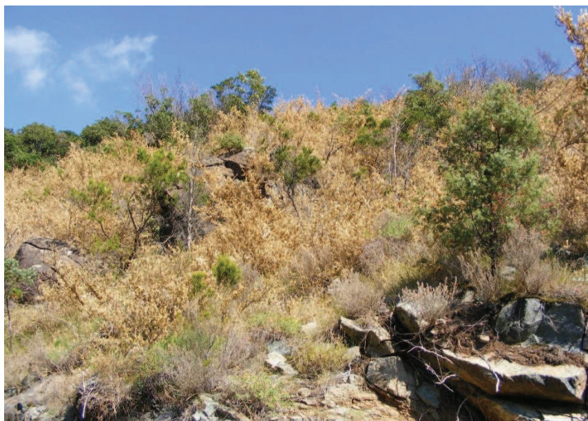
Fig. 4. Significant damage caused by C. perspectalis to the Box tree, dominant species of the Habitat 5110, in the SAC IT1342806 (July 2016).