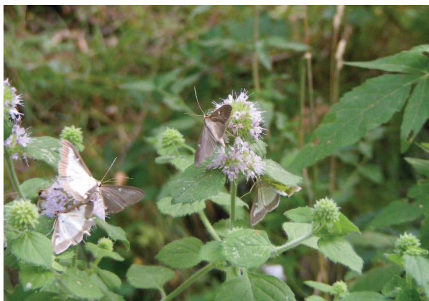
Fig. 1. Adults of C. perspectalis and some melanic specimens

In Liguria the Box three moth was observed for the first time in summer 2013 in Hanbury Botanical Gardens (Ventimiglia, IM) by the Gardens's staff (unpublished data), probably arriving from France, but reputedly it was present in the surroundings of Genova before that time and it has been widespread in 2014 (Redazione IVG.it, 2014; FEI, 2014a). Records from this region, and from Italy as a whole, were at first exclusively from parks and gardens. Following observations carried out on 22 nd July 2016 in Monte Carme di Stedomelli (SP), one of us (F.B.), working for the State Forestry Corp, informed the Regional Agency for Environmental Protection (ARPAL) about a severe attack suffered by wild Buxus plants via a concise report in which concern about ongoing defoliation was raised, and C. perspectalis put forward as the likely pest.