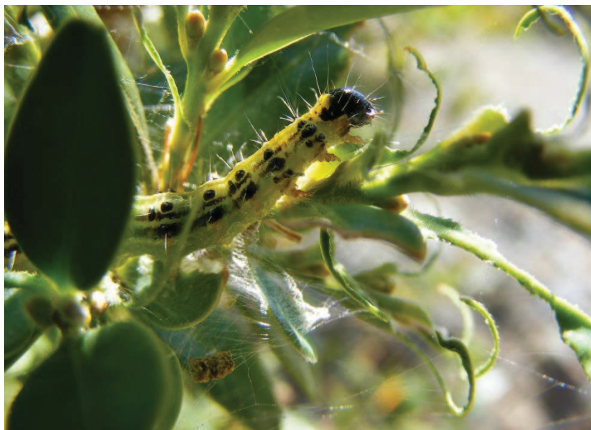
Fig. 3. Larva of C. perspectalis and its damage on leaves and young twigs of Buxus tree

Visual inspections following also the so-called “walking census method” and attention was dedicated also to spotting eggs and other juvenile instars of the pest on Box plants (Jervis & Kidd, 1996).