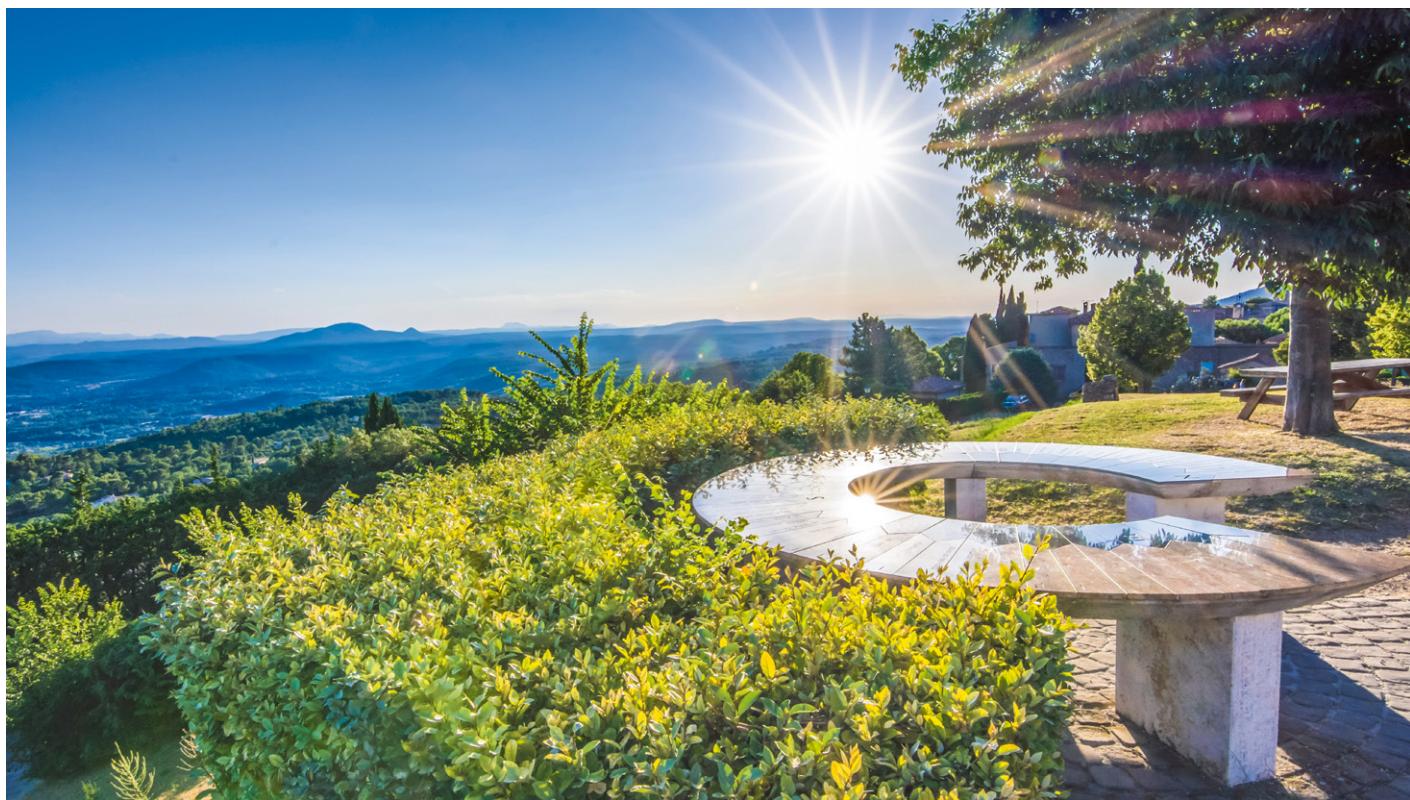
Tourtour is considered as one of the most beautiful villages of France and offers views over Provence